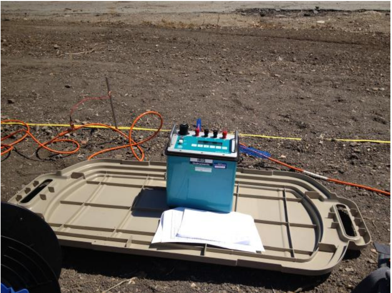
Figure 3 ALWAYS make sure the Syscal KID unit is dry. Even if the ground is dry, it is still good practice to put the unit on the bin lid in order to prevent dirt from getting in the connectors. Note how the electrode and switching cable connector are suspended in the air.